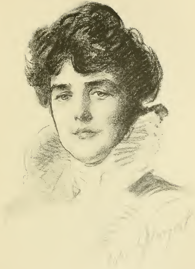
Lady Randolph Churchill From a drawing by John S. Sargent, R. A.